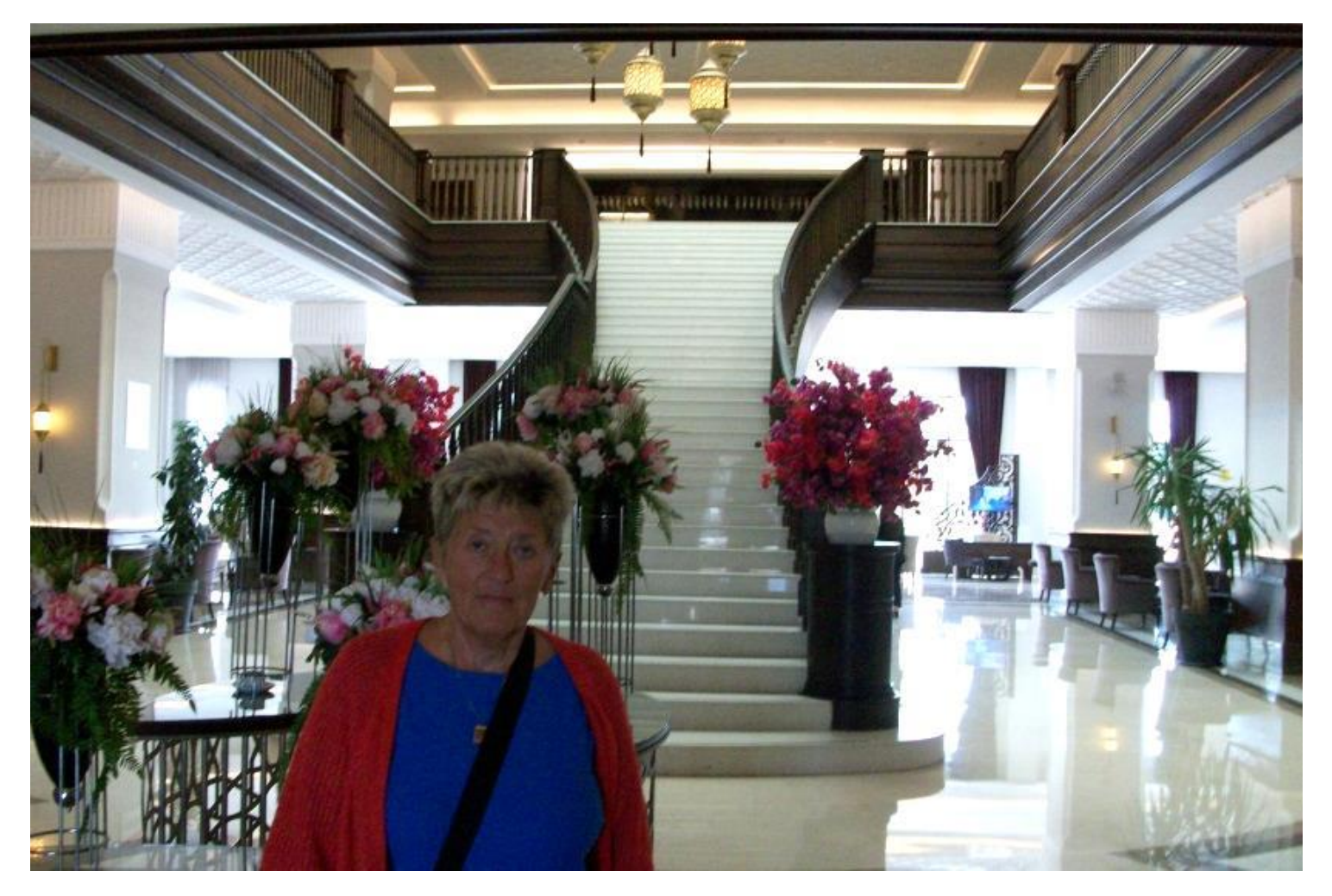
At the main staircase of the Topkapi Palace Hotel