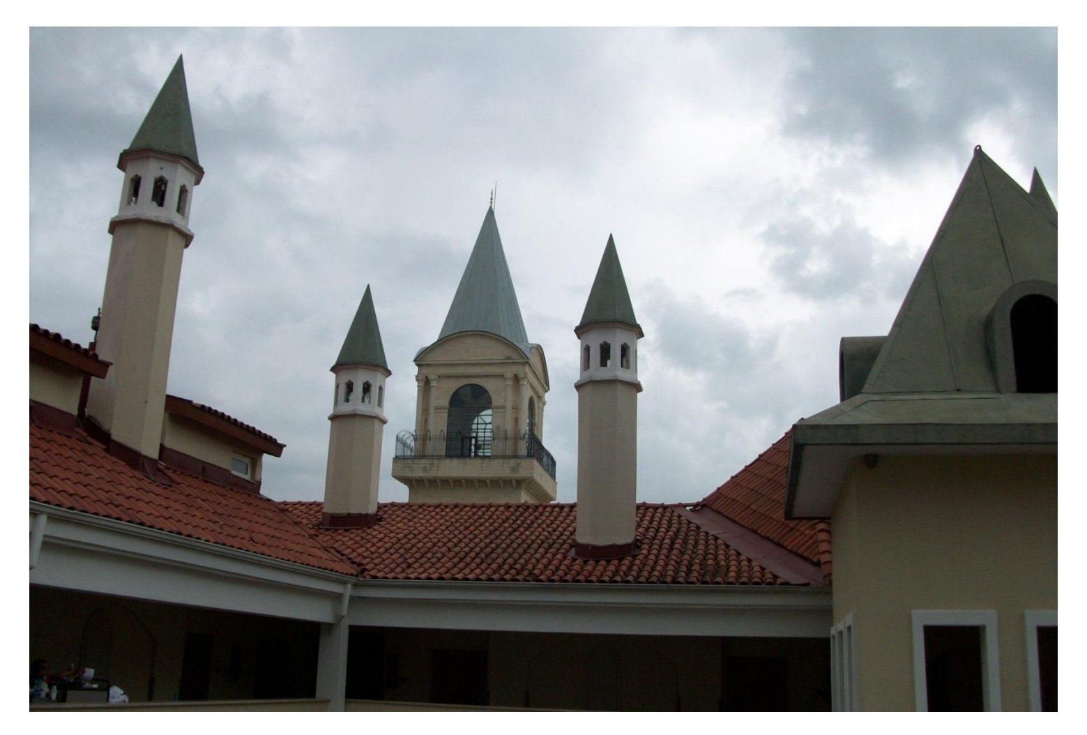
View of the Tower of Justice from building No. 2