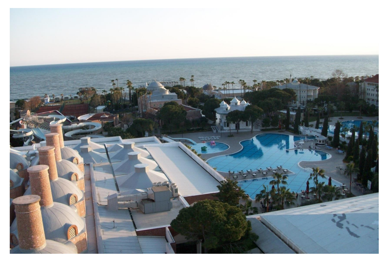
View of the pool and sea from the Tower of Justice